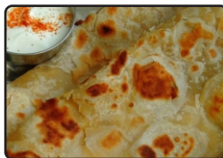
Sheermal & Warkhi Paratha